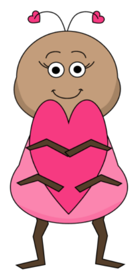
Hug A Stuffed Animal or Pillow:

Count or Sing the ABCs: Have your child count as high as he can or sing/say the alphabet. Many times this is enough to bring the breathing back under control to quell the tantrum.