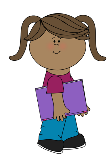
Take A Walk:

Have your child hold his hands in front of his mouth like holding a small balloon. Tell your child to blow up the balloon. As he blows, he spreads his hands apart to pretend the balloon is getting bigger. Once the balloon is as big as it can get, your child claps his hands together to "pop" the balloon.